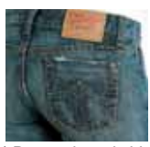
* Decorative stitching on back pockets.

* Sits Low On The Waist * Slim Fit Though Thigh * Slightly Flared Leg * Great New Piecing Detail On Back Pockets * Stetson Branded Buttons Rivets, And Zippers * Dark Ink Blast Wash CONTENT: 100% Cotton Color: Royal Dark Sizes: Waist: 0-16" Length: R(32") L(34") XL(36") XXL(38") State item number and size.