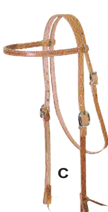
C. BROWBAND Harness leather with adjustable cheek pieces. H101132 $17.50