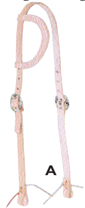
A. ONE EAR Harness Leather with adjustable cheek. HEAD500 $12.50

Amish Made and of Excellent Working Quality. MADE IN AMERICA Long Lasting & Heavy Duty, Herman Oak Harness Leather