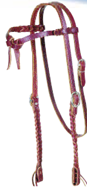
A. BRAIDED/KNOT Latigo leather browband with braided cheek pieces and futurity knot. H101423 $20.00