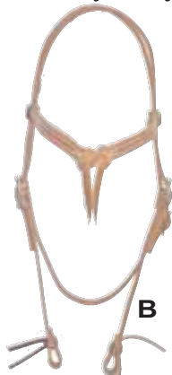
B. BROWBAND/FUTURITY KNOT Harness Leather Browband with futurity knot. HEAD5009 $17.50