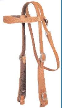
B. COWBOY HEADSTALL Premium leather wide cheeked headstall with basketstamping. H101471 $32.50